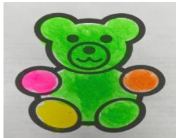
Holly Durnford Reception