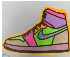
Hattie Cooper-Finch Y5