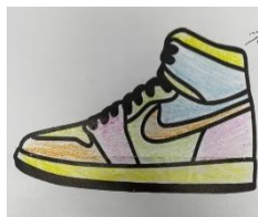
Holly Hayes-Wade Y3