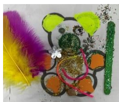
Alfie Burns Nursery

Congratulations to all our winners of our 'Be Bright Be Seen' competition. I hope you liked your prizes!